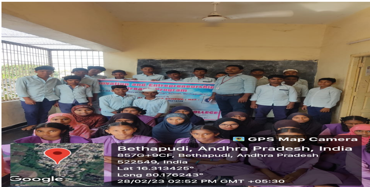
Group Photo of the school students along with Resource person